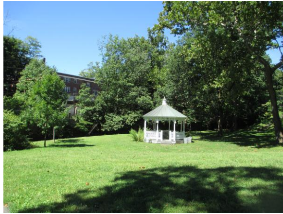
The Gazebo in The Glen. The Final Days of Summer.