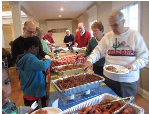
BBQ Bash is May 7 th at GR Women's Club. 6:30pm.