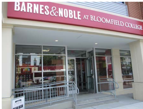
Barnes & Noble now open. Broad Street in Bloomfield Center.