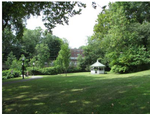
The Waning Days Of Summer In The Glen.