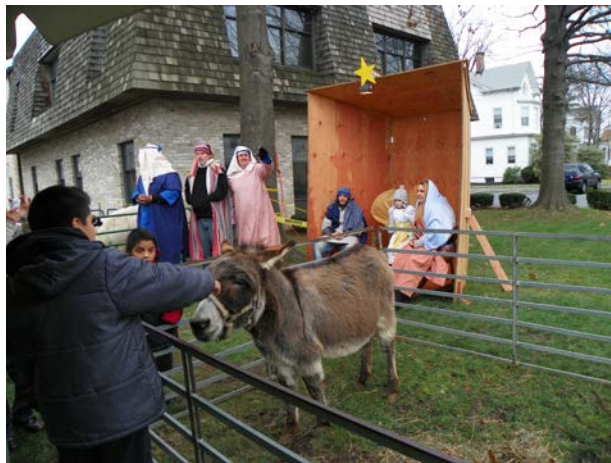
Live Nativity Scene sponsored by The Van Tassel Funeral Home. Bloomfield. December 2012.