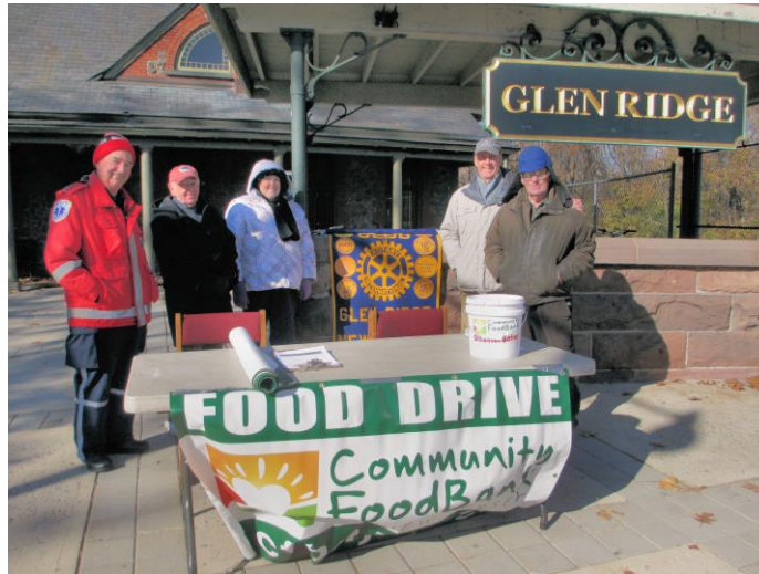
Glen Ridge Rotarians collecting frozen turkeys & canned goods to benefit Community Food Bank. 11/22/14.