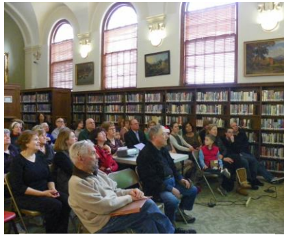
The Glen Ridge Public Library