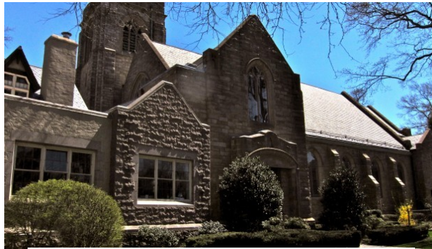
The Presbyterian Church of Upper Montclair