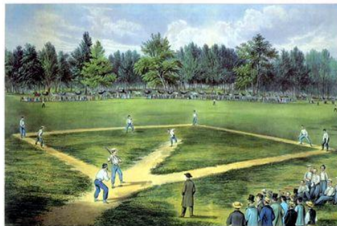
THE AMERICAN NATIONAL GAME OF BASE BALL GRAND MATCH FOR THE CHAMPIONSHIP AT THE ELYSIAN FIELDS, HOBOKEN, N.J.

Championship game played on Hoboken's Elysian Fields. August 3, 1865