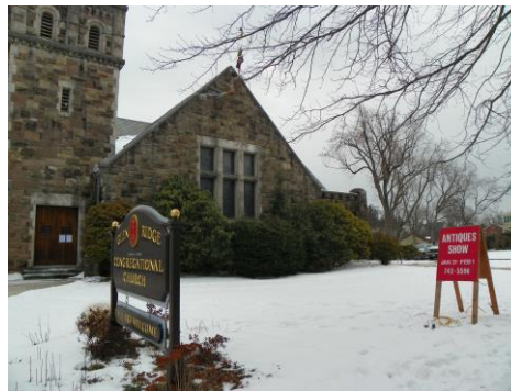
Glen Ridge Antiques Show at Congregational Church.