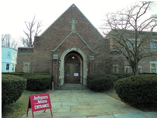
Glen Ridge Antiques Show. At the GR Congregational Church Friday January 31 st & Saturday February 1 st