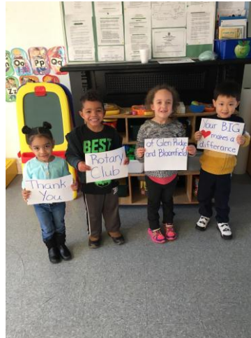
Words of Thanks from the Family Day Nursery