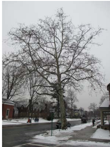
Winter Wonderland on Ridgewood Avenue.