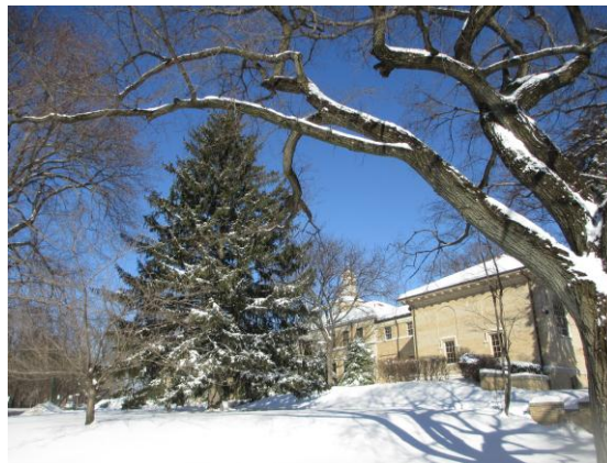
The Tree At The Glen Ridge Municipal Building

Today's Program: Carl Bergmanson: Kiwanis/Rotary "Holiday Tree Challenge."