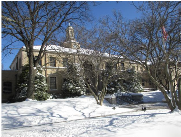
Winter Storm Drops 6" of Snow on Glen Ridge