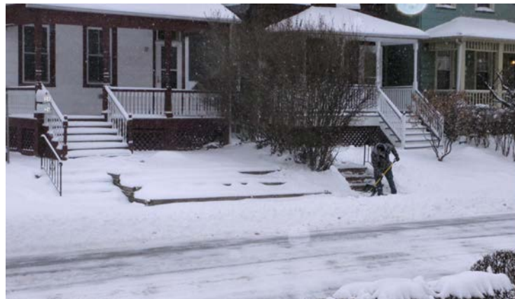
Blizz Fizz: Juno = Just another winter storm.