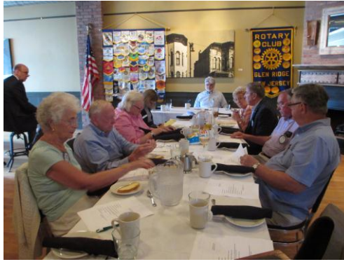
The July board meeting was held last week.