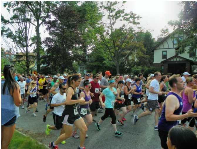
Fitzgerald's 1928 Lager Run is Sunday June 22 at 6:30pm.