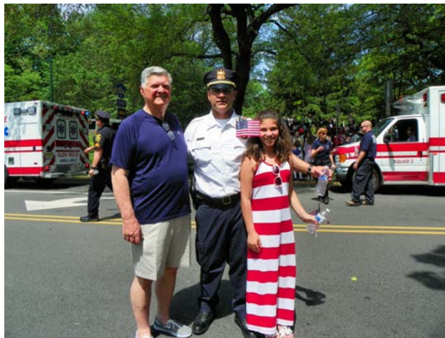
Three Wohlgemuth generations at the Glen Ridge Memorial Day Parade..