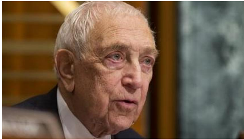
Remembering Senator Frank Lautenberg , 5-term senator and octogenarian.

Today's Program: GRPD, "Child ID Program."