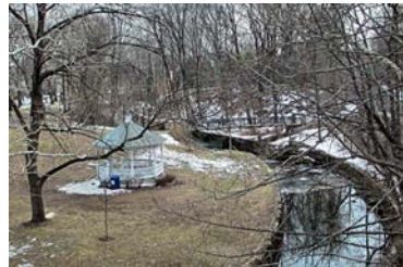
Friday, March 20 th is the first day of Spring.