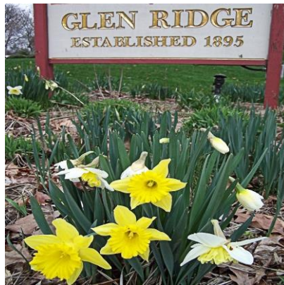
Springtime in Glen Ridge.