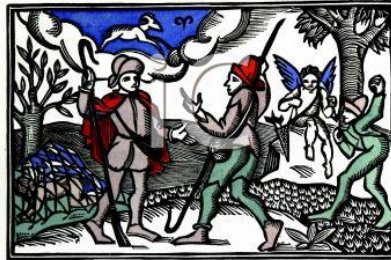
Old English Zodiac Calendar for March