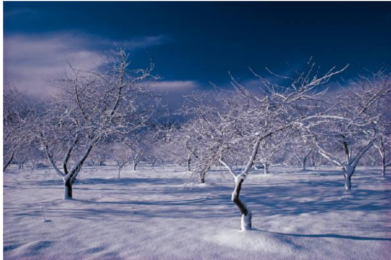
Where Is Spring??? I think we spoke to soon!!!!