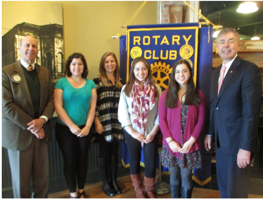
Members of GRHS's "Sharing The Arts" were our guests last week.