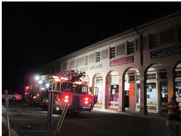
Electrical fire at Glen Ridge Arcade Building brings excitement to Herman Street last Friday night.