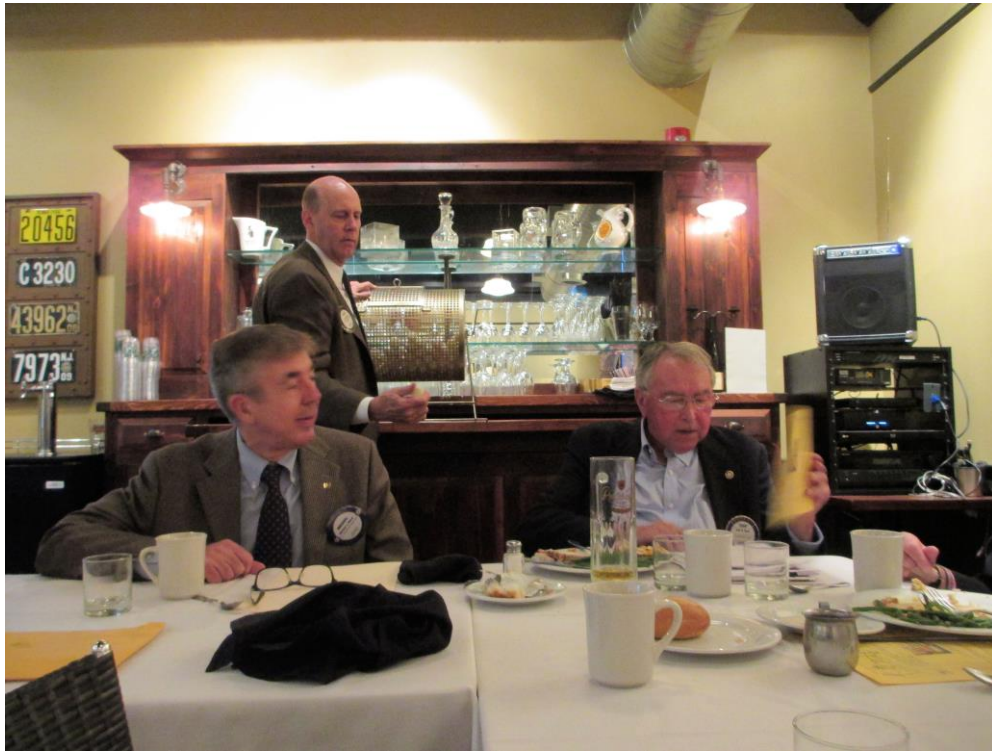
The President's Club Special Drawing was held at last week's meeting.