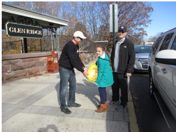
Take Your Turkey To The GR Train Station On Saturday.