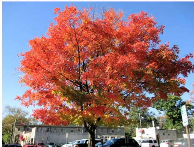
Fall Foliage Peaks on Herman Street.