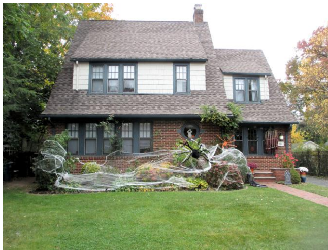
Halloween on Hawthorne Avenue.