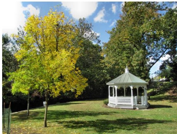
Autumn in The Glen

Today's Program: Postponed. (Ethical Concerns for the Mature Adult.)