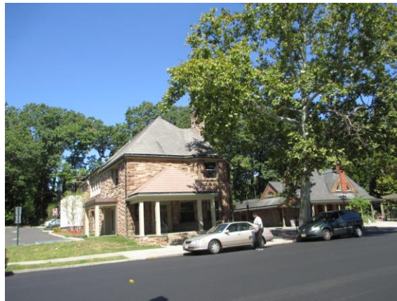
The Boiling Springs Savings Bank on recently repaved Ridgewood Avenue.