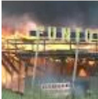
Rebuilt after the storm. Fire ravages Funtown Pier in Seaside.

Today's Program: : Today's program - postponed until October 17th