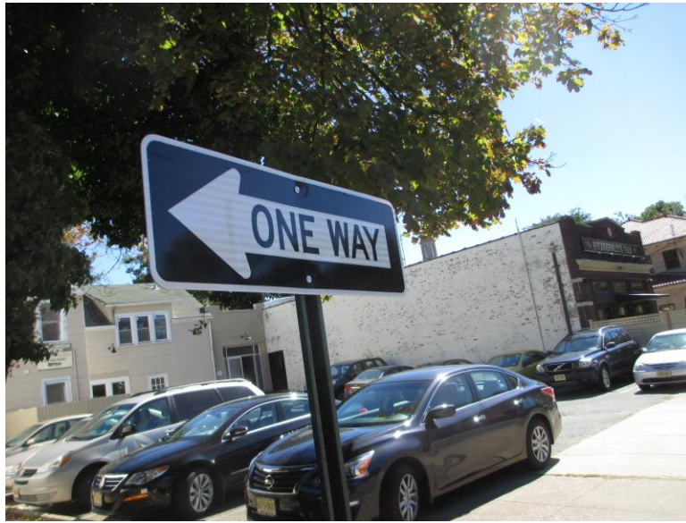
GR DPW installed a new “One Way” sign on Herman Street. Shade trees to follow soon?