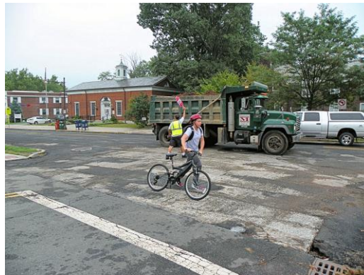
The repaving of Ridgewood Avenue added to the excitement of Back To School Day in Glen Ridge last Tuesday.

Today's Program: August Board Meeting today.